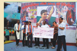
Promoting excellence in sports

For The Employees & Their Families : Facilities & Amenities For The Poor & Under-Privileged Health Check-up Camps Free Schooling Sponsorship of Sports. Community Weddings. Tree Plantation Drives. Environmentally Friendly Practices