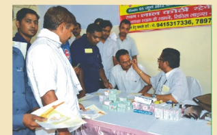
Health checkup & medicine distribution camp

SHYAM GROUP also promotes excellence in sports by sponsoring sports activities & rewarding achievers. We believe in strengthening the hands that build the nation and to nurture the resources that corroborate our vision to improve the quality of life everywhere. Regular Health Check up camps are organised regularly. The Group is dedicated to protecting the environment by adopting eco-friendly processes and activities, like : improving roads, organising tree plantation drives & maintaining parks.